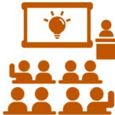
Classes taught by ATI directors