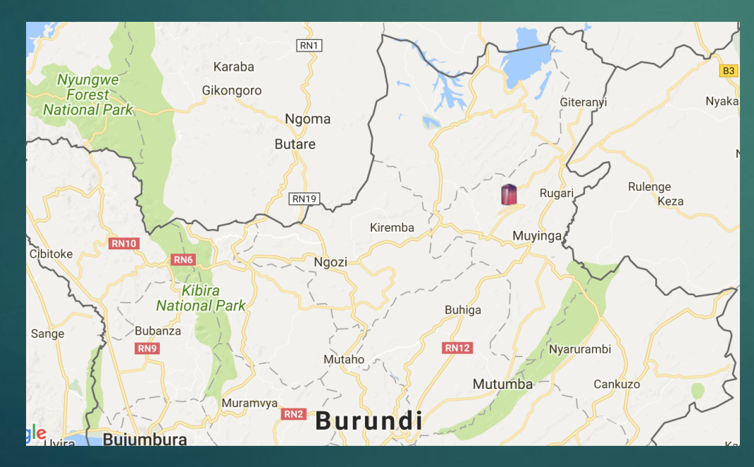
Fig 1. Burundi Map- Muyinga mines situated in the East of Burundi.